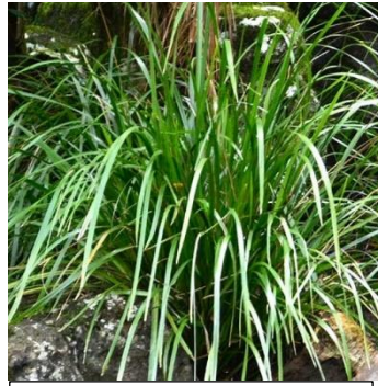
Mat-rush - Lomandra longifolia