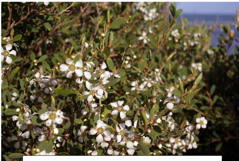
Coastal Tee Tree - Leptospermum laevigatum