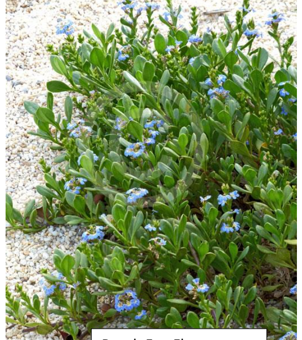
Beach Fan Flower – Scaevola calendulacea