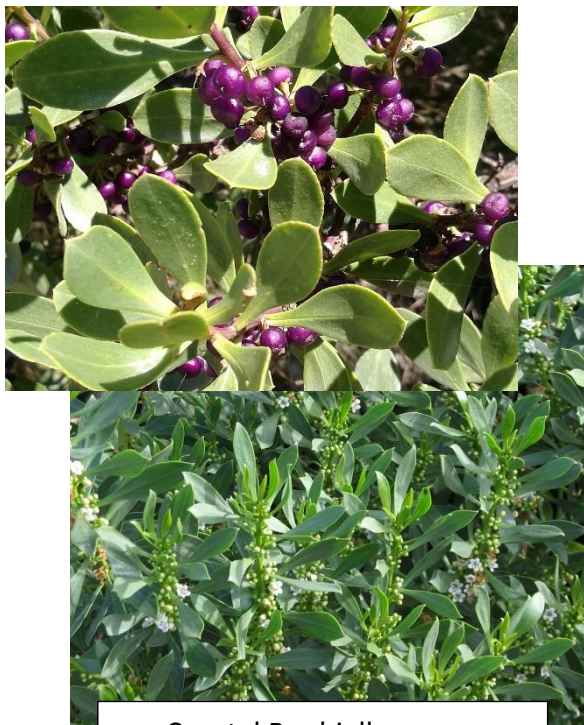
Coastal Boobialla - Myoporum insulare